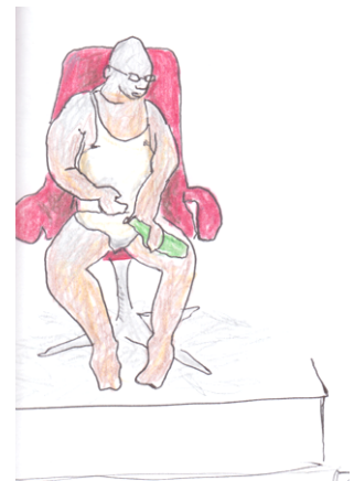
Macbeth drowns his sorrows