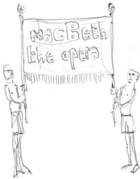
macbEth: the opera

macbEth: some designs by Brett Bailey (photos of previous productions can be found on the macbEth page of www.thirdworldbunfight.co.za )