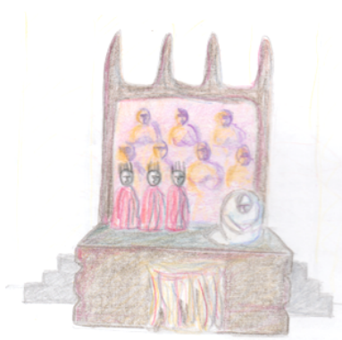
Macbeth & apparitions