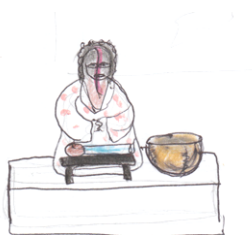
Lady M plots murder